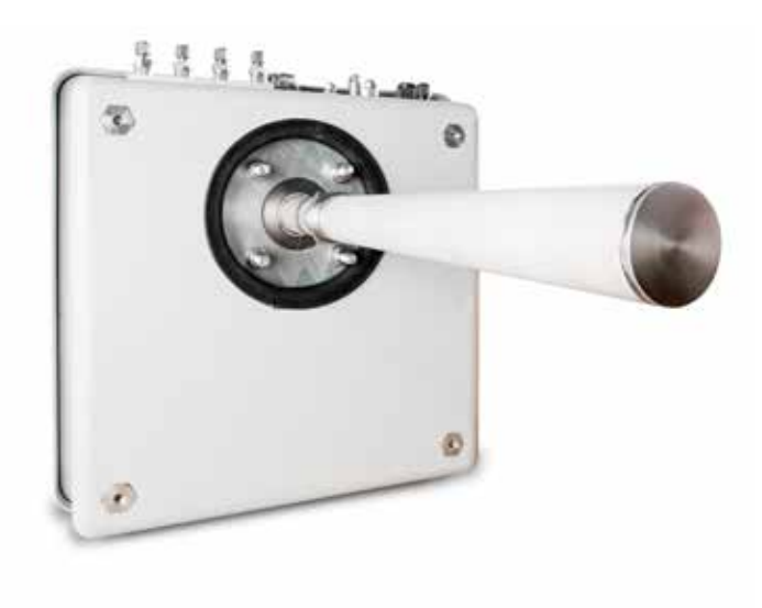
Fig. SILOTEC probe