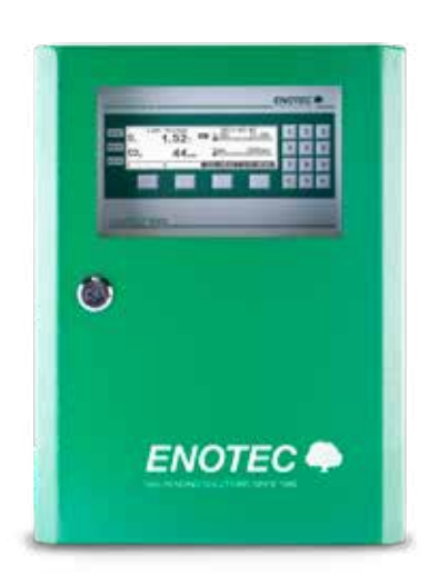
Fig. SILOTEC 8000 analyzer system